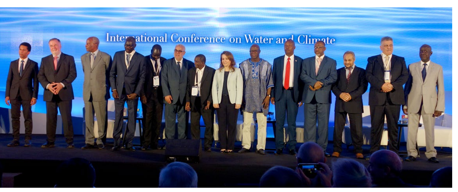
International Conference on Water and Climate, Rabat, Morocco, 11 July 2016