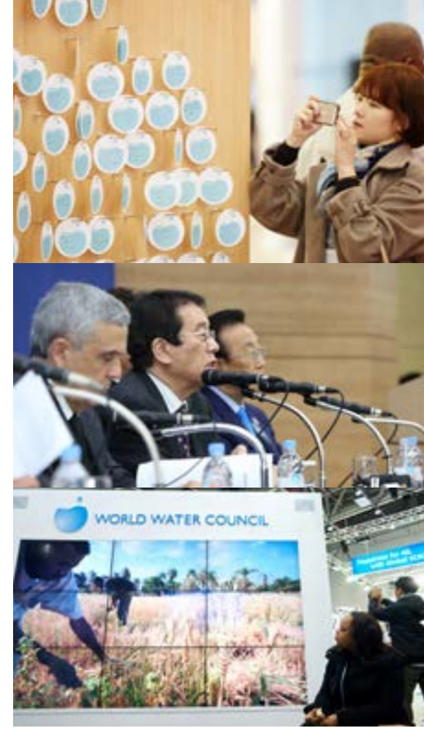
A visitor to the World Water Council Pavilion; The press conference on the day of the opening; The WWC's new video was launched during the 7<sup>th</sup> World Water Forum.