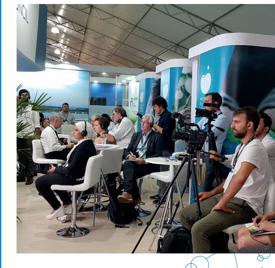
Journalists attend a press briefing at the Council pavilion