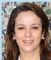
Charafat Afailal El Yedri

Secretary of State to the Minister of Equipment, Transport, Logistics and Water, in charge of water