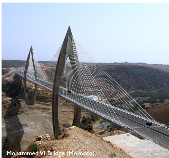
Mohammed VI Bridge (Morocco)