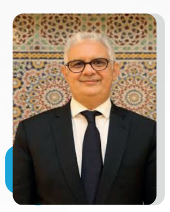
M. Nizar BARAKA

Minister of Equipment and Water Chairman of the Standing Committee