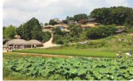
Daytime (Traditional Houses of Yangdong Village, UNESCO World Heritage)