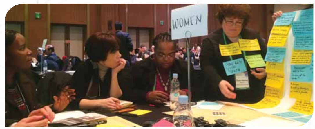
The Citizen's Forum Break-out Session of the 2nd Stakeholders Consultation Meeting, Gyeongju, 28 February 2014

If you are a CSO with a water-related agenda, and want to create and execute your own program at the 7<sup>th</sup> World Water Forum, you are welcome to submit your own proposal. You can develop various types of activities that can serve to enrich the Forum's program, such as sessions, exhibitions, cultural performances, and lectures. If you need more guidance or want to submit your proposal, contact citizens7@worldwaterforum7.org