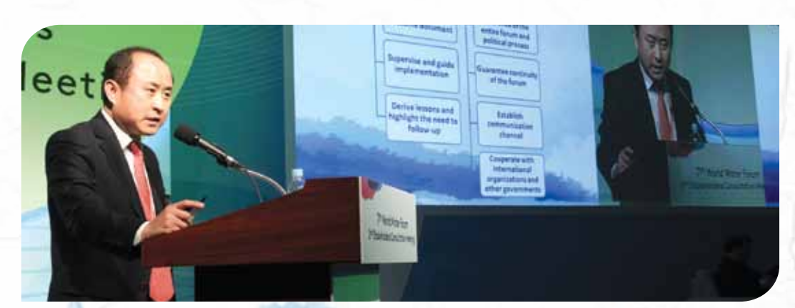
The \ Political \ Process \ Plenary \ Session \ of \ the \ 2^{nd} \ Stakeholders \ Consultation \ Meeting, \ Gyeongju, \ 27 \ February \ 2014

The Political Process will be informed by all the discussions of the other three Processes. If you want to get involved, contact our coordinators. You can find contact points in Appendix 3.