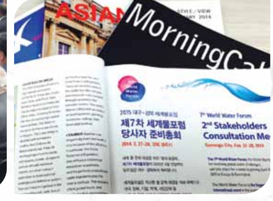
the 7th World Water Forum, 27~28 February 2014