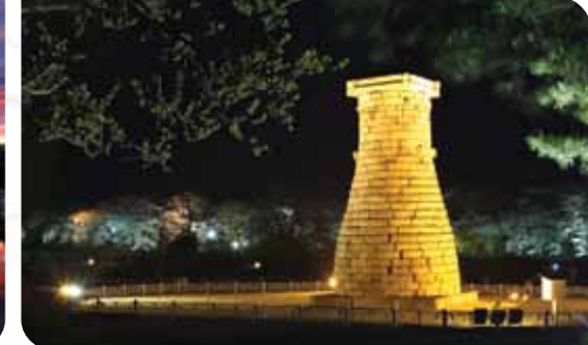
Night (Cheomseongdae, the orient's first observatory)