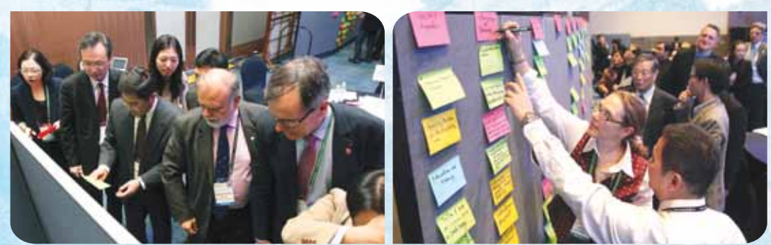
The Science & Technology Process Break-out Session of the 2nd Stakeholders Consultation Meeting, Gyeongiu, 28 February 2014

- World Water Challenges will be a competition program for sustainable and innovative scientific and technological projects serving to bridge problem owners and solution providers. By sharing know-how and best practices, leading cases of water policies and strategies from both the public and private sector will be selected to form the basis of a coherent set of 'Policy-Economy-Technology-Practice' examples.