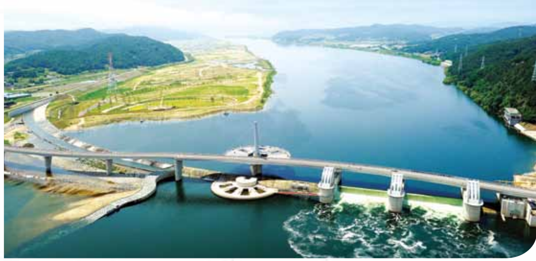
The Four Seasons of the Year, Daegu Summer (Gangjeong Goryeong Weir in the Nakdong River)

Daegu, with its population of around 2.5 million, is the third largest city of the Republic of Korea. The well-preserved ecosystems of the Nakdong and Geumho Rivers, and Shincheon stream that flow through the city are symbols of its accomplishments in sustainable development.