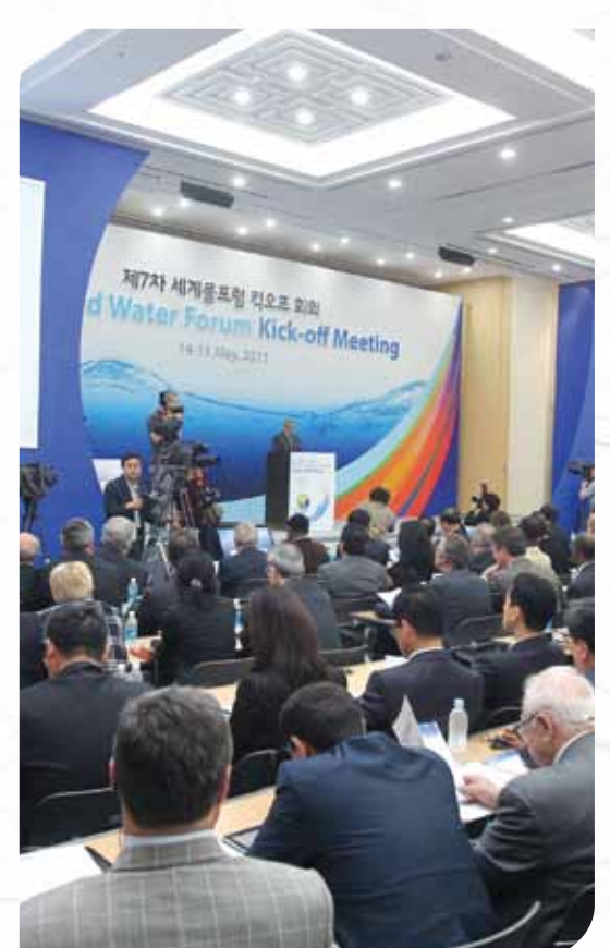
Media covering the 7th World Water Forum Kick-off Meeting, 13~15 May 2013

Media contact: For further information such as special requests and interviews, please write to media@ worldwaterforum7.org.