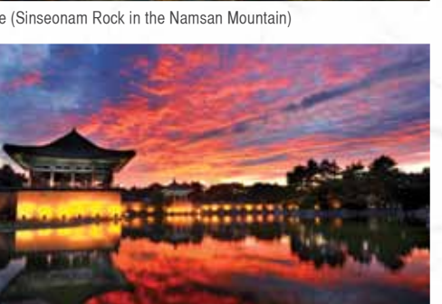
Sunset (Donggung and Wolji, the banquet hall of the Silla Dynasty)