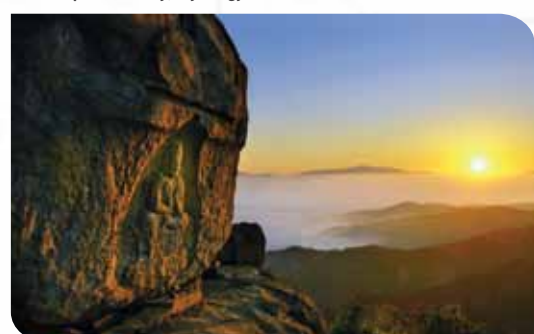
Sunrise (Sinseonam Rock in the Namsan Mountain)