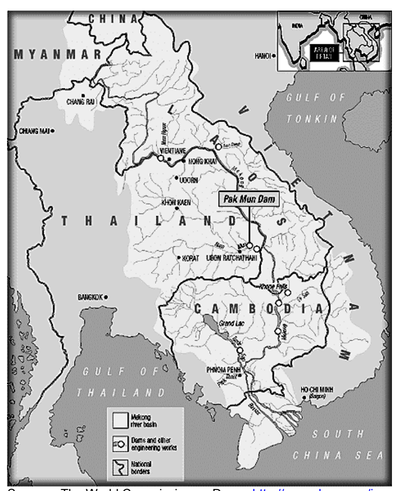
Appendix 1: Location of Pak Mun Dam, Thailand