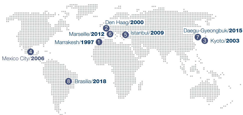
World Water Forum events since 1996

In addition to the World Water Council's main initiatives, members are also encouraged to propose work on new and emerging issues, such as developing a World Water System Heritage, exploring the role of technology and big data in Smart Water Management or water accounting for agriculture.