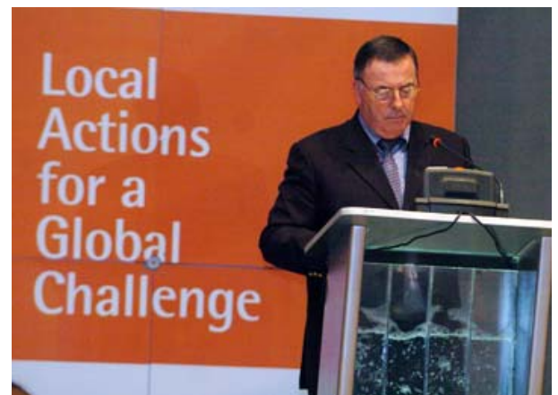
Loïc Fauchon at the opening ceremony of the 4th World Water Forum - Photo courtesy of Leila Mead/IIISD