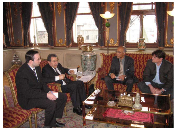
Representatives of the Turkish authorities and the World Water Council holding discussion

Next Forum: Discussions have commenced with the Turkish government to determine the principles and the process for the preparation and organisation of the 5th World Water Forum in Istanbul in 2009. A first meeting was held at the WWC Headquarters in Marseille on 13 April, and a second took place in Istanbul on 28 April.