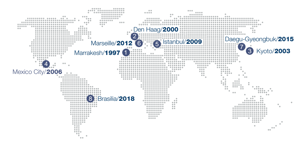
World Water Forum events since 1996

To strengthen and deepen political engagement, the Council works with governments, parliamentarians and partners to increase the visibility of water on the agenda of key multilateral political forums.