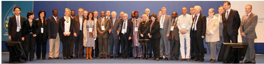
Local Authorities supporting the IWC at the 6th World Water Forum