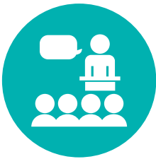
courses and workshops

The programme developed through the week focuses on capacity building and updating through courses and workshops, keynote speeches and discussion panels with international speakers. Additionally, book presentations, special sessions, technical skills competitions, award ceremonies, and a wide offer of side events organised in collaboration with national and international institutions.